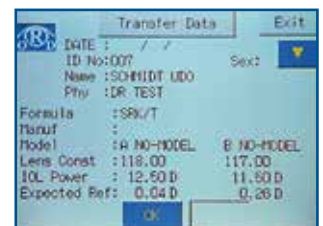
Comfortable data transfer to memory card or RS-232 port