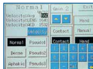
The AL-100 provides full access to ultrasound velocities